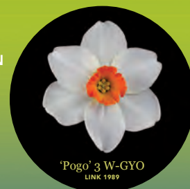
'Pogo' 3 W-GYO LINK 1989