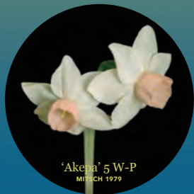
'Akeia' 5 W-P MITSCH 1979