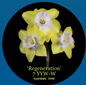
'Regeneration' 7 YYW-W HAVENS 1995