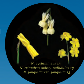
N. cyclamineus 13 N. triandrus subsp. pallidulus 13 N. jonquilla var. jonquilla 13