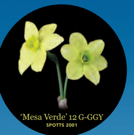
'Mesa Verde' 12 G-GGY SPOTTS 2001