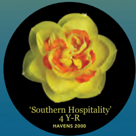
'Southern Hospitality' 4 Y-R HAVENS 2000