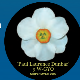
'Paul Laurence Dunbar' 9