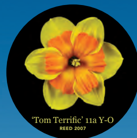
'Tom Terrific' 11a Y-O REED 2007