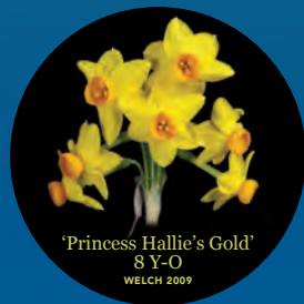
'Princess Hallie's Gold' 8 Y-O WELCH 2009