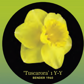
'Tuscarora' 1 Y-Y BENDER 1960