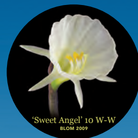
'Sweet Angel' 10 W-W BLOM 2009