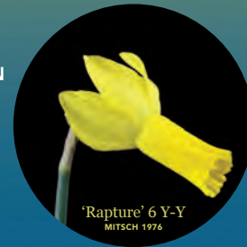
'Rapture' 6 Y-Y MITSCH 1976