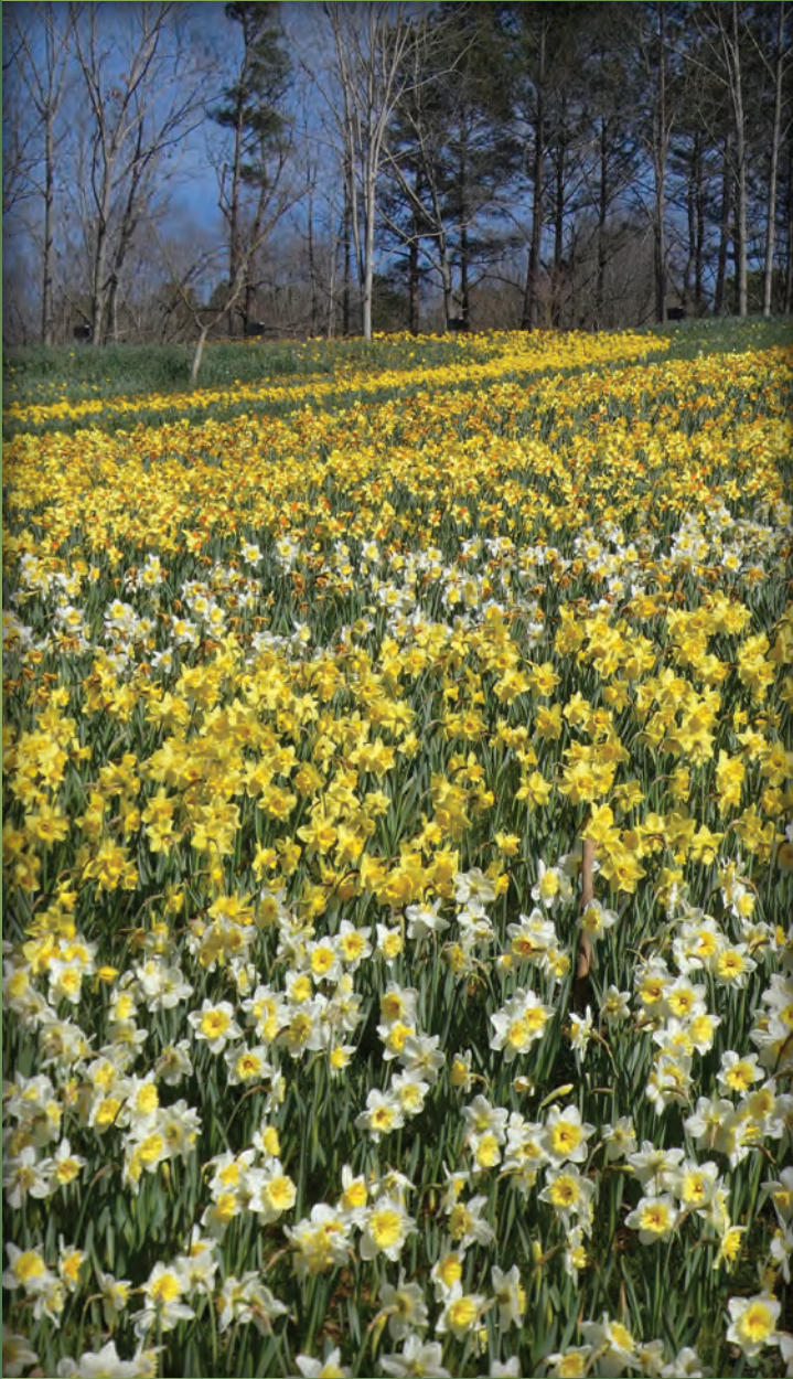
Gibbs Gardens in Atlanta