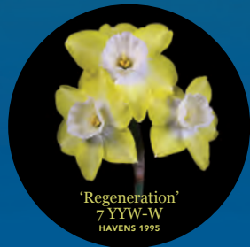
'Regeneration' 7 YYW-W HAVENS 1995