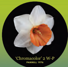
'Chromacolor' 2 W-P PANNILL 1976