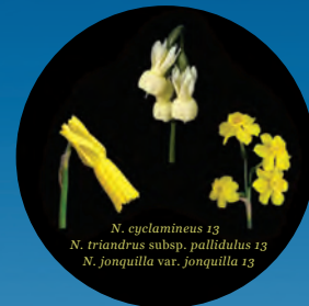
N. cyclamineus 13 N. triandrus subsp. pallidulus 13 N. jonquilla var. jonquilla 13