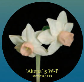
'Akepa' 5 W-P MITSCH 1979