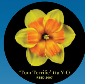
'Tom Terrific' 11a Y-O REED 2007