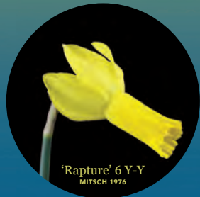
'Rapture' 6 Y-Y MITSCH 1976