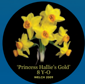
'Princess Hallie's Gold' 8 Y-O WELCH 2009