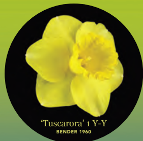
'Tuscarora' 1 Y-Y BENDER 1960