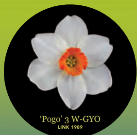
'Pogo' 3 W-GYO LINK 1989