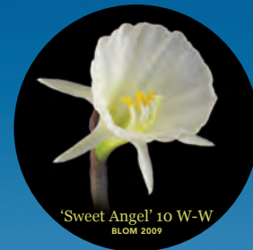
'Sweet Angel' 10 W-W BLOM 2009