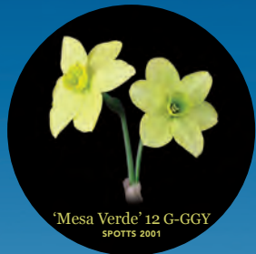
'Mesa Verde' 12 G-GGY SPOTTS 2001